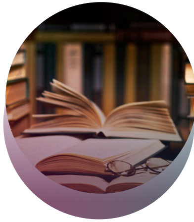
Highly developed training materials