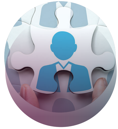
Highly experienced and qualified trainers